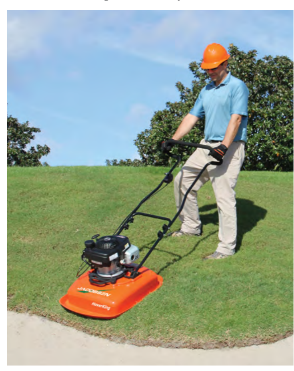
The HoverKing's light weight and ergonomic design make it easy to maneuver, even on steep inclines.