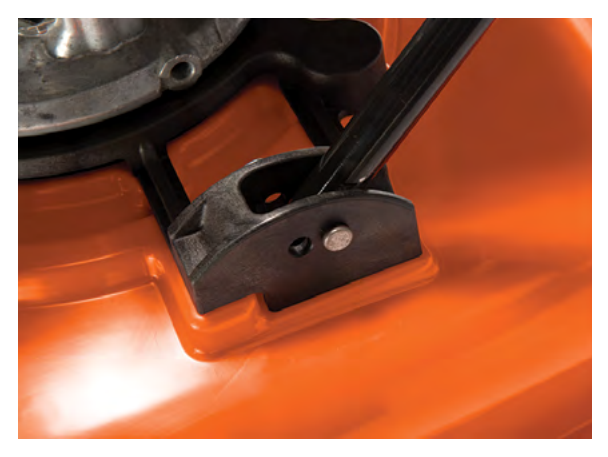
The HoverKing's engine mounts are integrated into the mower's deck, making them extremely durable.